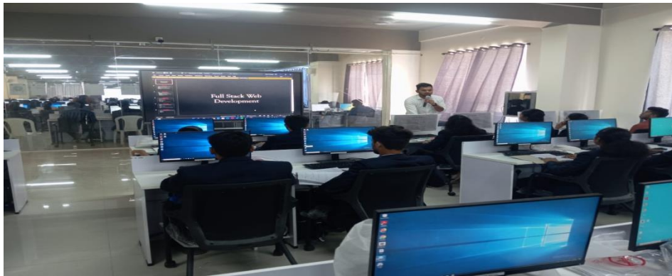
20-02-2024, 1:20PM-3:50PM (CSE(AI&ML)- A& B IT- C: Room No.7113)