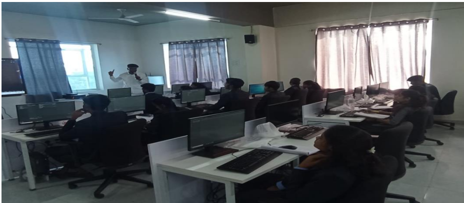
20-02-2024, 9:20AM-11:50 AM-(CSE & IT Room No.7113)