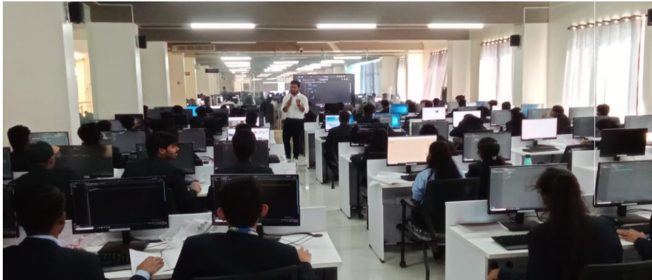
20-02-2024, 9:20AM-11:50 AM-(CSE: Room No.7112)