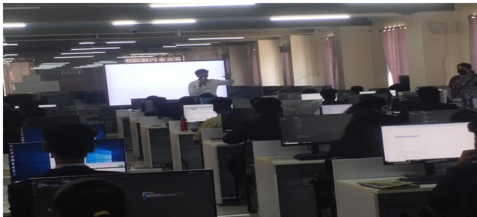
20-02-2024, 1:20PM-3:50PM ( IT- B& C: Room No.7112)